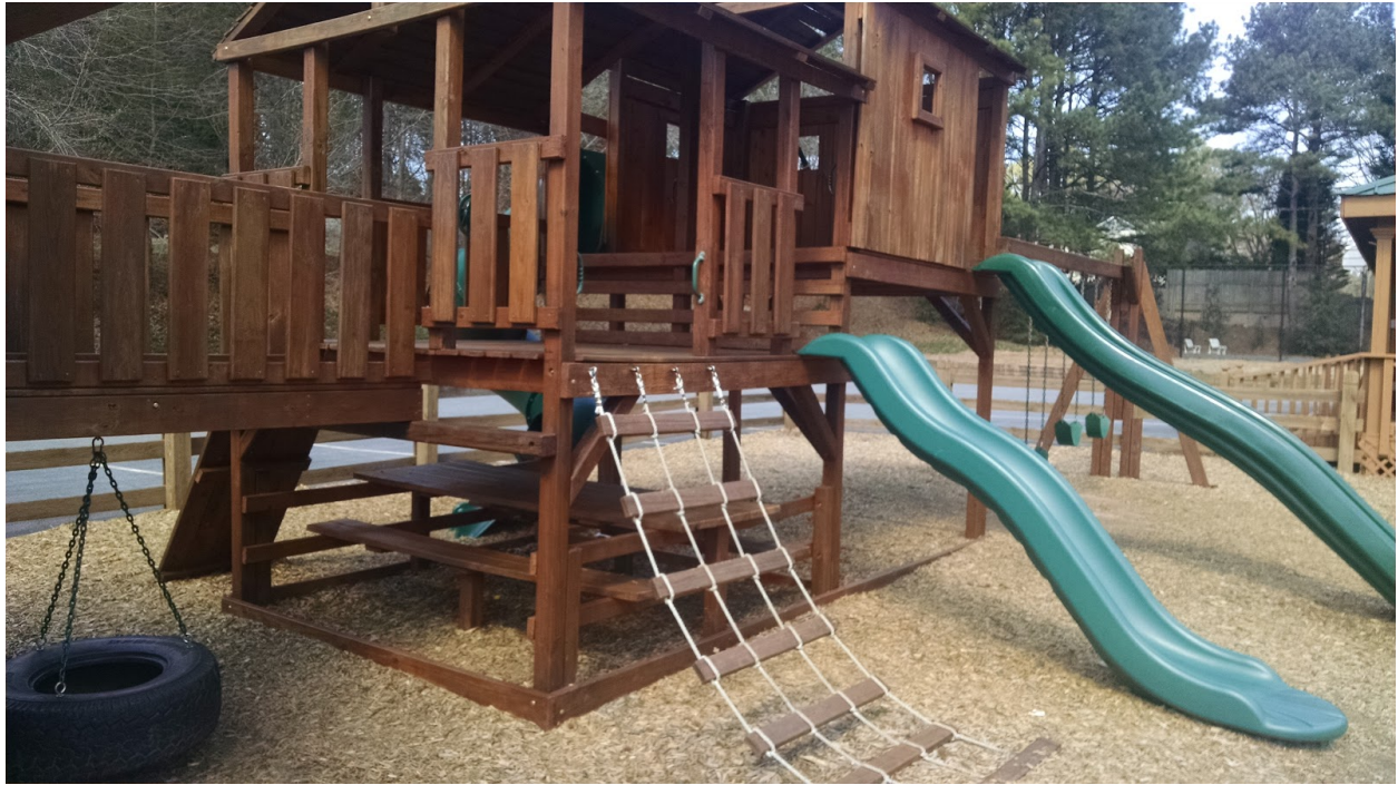
Sample Work Brian Pound LLC Hybrid Wood